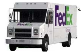
Real Time Manifest Integrated

Integrated real-time manifest with FedEx or any other shipper system enables "just-in-time" vendor managed inventory insuring Next Day or 2 Day deliveries.