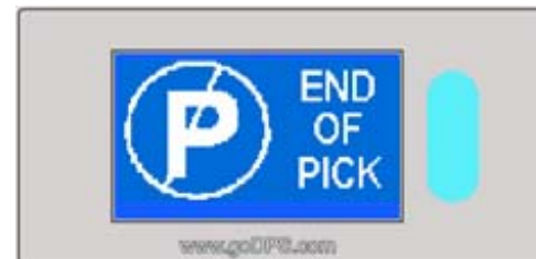
No More Picks This Zone Displayed

To facilitate LOOSE and BUNDLE picks from same BIN location, Violet or an alternate color is used with display indicating 21 loose and 4 bundles are to be picked. Current Invoice and Customer shown