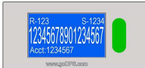
Zone Master Display

iPICK presents an ability to quickly instruct and guide order picking using eight different user defined button light color combinations. The bright user defined LED button color (7, plus no light) will notify pick staff of the type of action expected at the product BIN location. The unique action color with informative large format displayed data or graphical image lowers training effort and increases pick accuracy. Depressing button confirms action / event.