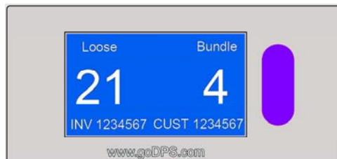
21 Loose Copy & 4 Bundles Pick Displayed

STOP – DO NOT ADVANCE to next pick as the picker in front of you is NOT FINISHED with current pick. This displays at ZONE MASTER when pick staff attempts to advance if you system setup indicates.