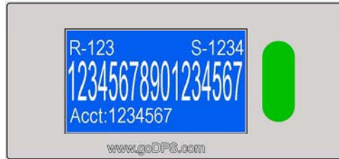
Zone Master Display

iPICK presents an ability to quickly instruct and guide order picking using eight different user defined button light color combinations. The bright user defined LED button color (7, plus no light) will notify pick staff of the type of action expected at the product BIN location. The unique action color with informative large format displayed data or graphical image lowers training effort and increases pick accuracy. Depressing button confirms action / event.