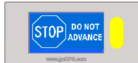
Do Not Advance to next Pick Displayed

Instruction at BIN level is complete with indication of type pick – LOOSE ONLY of 21 copies. A Red LED button might tell the pick staff to expect loose copies only in this pick. Current Invoice and Customer shown