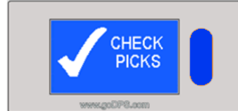
Check Picks Displayed

Route, sequence, invoice, and account numbers displayed on ZONE MASTERS (beginning and end of a pick section/zone). Green LED can visually defines the ZONE area the picker is responsible