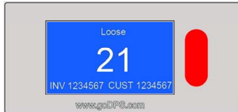
21 Loose Copy Pick Displayed

CHECK PICKS instructs pick staff to find miss picks. By looking back at Zone, illuminated Buttons such as Blue indicate what BIN was missed. Depressing button CONFIRMS pick.