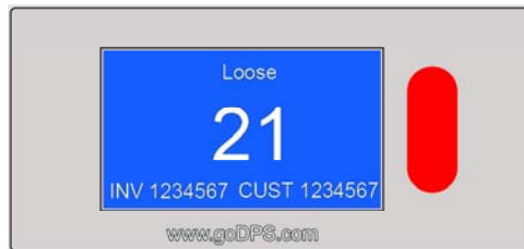
21 Loose Copy Pick Displayed

CHECK PICKS instructs pick staff to find miss picks. By looking back at Zone, illuminated Buttons such as Blue indicate what BIN was missed. Depressing button CONFIRMS pick.