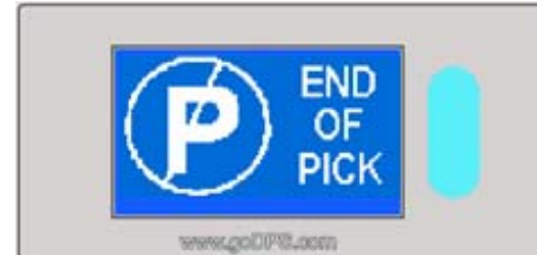
No More Picks This Zone Displayed

To facilitate LOOSE and BUNDLE picks from same BIN location, Violet or an alternate color is used with display indicating 21 loose and 4 bundles are to be picked. Current Invoice and Customer shown