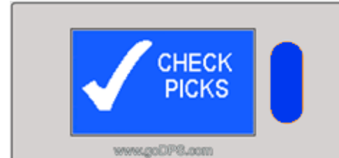
Check Picks Displayed

Route, sequence, invoice, and account numbers displayed on ZONE MASTERS (beginning and end of a pick section/zone). Green LED can visually defines the ZONE area the picker is responsible