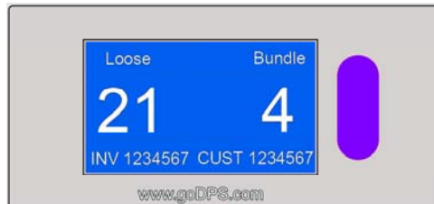
21 Loose Copy & 4 Bundles Pick Displayed

STOP – DO NOT ADVANCE to next pick as the picker in front of you is NOT FINISHED with current pick. This displays at ZONE MASTER when pick staff attempts to advance if you system setup indicates.