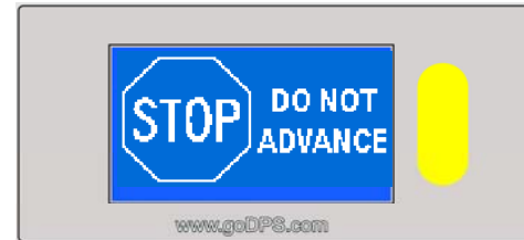
Do Not Advance to next Pick Displayed

Instruction at BIN level is complete with indication of type pick – LOOSE ONLY of 21 copies. A Red LED button might tell the pick staff to expect loose copies only in this pick. Current Invoice and Customer shown